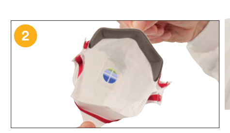
2. Pull chin and nose panel tabs until the noseclip bends so that the respirator forms a cup shape. Ensure both panels are fully unfolded.

Respirator should be correctly positioned on the face using the graspable valve and/or by adjusting the top and bottom panels, using the tabs