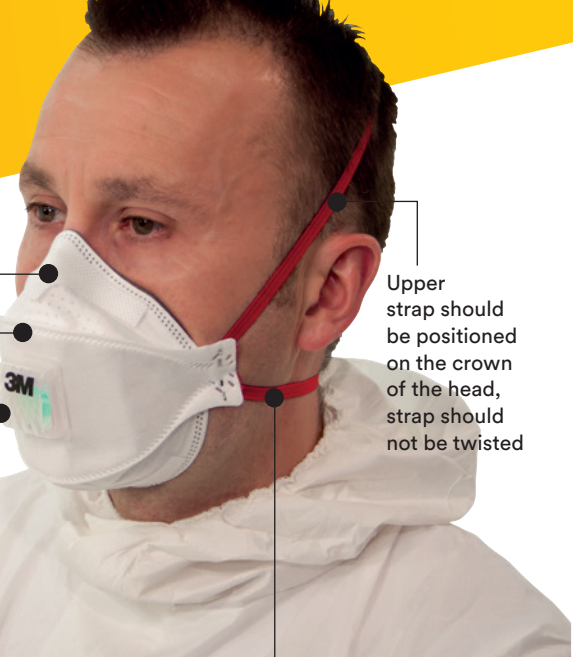
Lower strap should be positioned below the ears. Strap should not be twisted