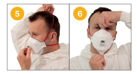
5. With other hand, take each strap in turn and pull each strap over your head.

4b) UNVALVED respirator – cup respirator in one hand with open side towards face.