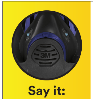
Utilise the speaking diaphragm to help provide easy communication.